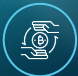
Margin Trading & Lending

BDCC COIN has implemented a system of maintaining standards in all products offered through projections, the KYC system and effective vigilance. BDCC COIN is offering German quality and commitment. Quality is every team member's responsibility, this ensures a complete and suitable package for each individual client with guaranteed satisfaction.