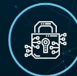
Security Mitigation Concepts (Anti Ddos)